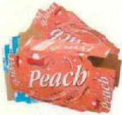
Carrier Stock (soda & beer can carrying cases)