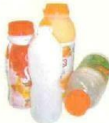
Milk and Juice Jugs