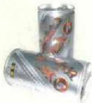
Aluminum Cans, Trays & Foil