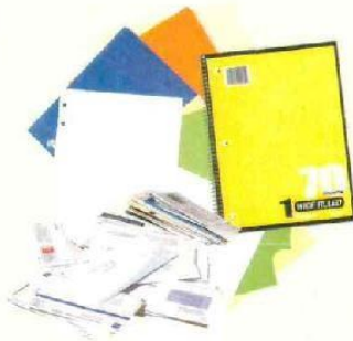
Office Paper, Newspaper, Envelopes, Folders & Spiral Notebooks