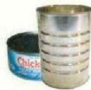
Steel Cans and Tins