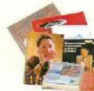
Magazines, Catalogs & Telephone Books