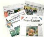
Newspaper, including inserts (remove plastic sleeves)