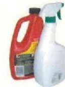
PVC Narrow Neck Containers (#3 Plastic Resin), such as health & beauty aid products, household cleaners