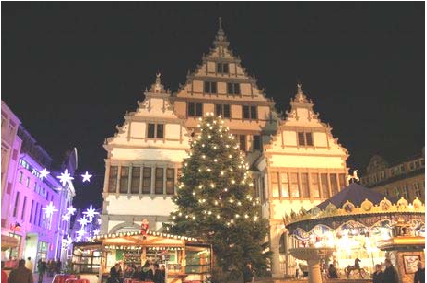
Part of the Paderborn Weihnmarkt with the Paderborn City Hall in the background